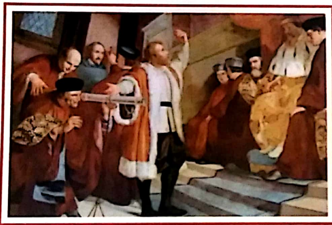
Fresco of Galileo standing before the pope (detail), 1841

Galileo Galilei was worried, maybe even afraid, and so was his daughter. It was 1633. The famous astronomer had been ordered to appear before the Holy Office of the Inquisition in Rome. Like any Catholic who drew the attention of the Inquisition court, Galileo was being investigated for actions that church officials believed went against the teachings of the Church. Galileo held the belief that the earth revolved around the sun. The Catholic Church did not. Galileo's daughter, Sister Maria Celeste, was aware of the dangers that awaited her father in Rome. During the months that her father spent in Rome, Sister Celeste wrote many letters to him, reassuring him and reminding him to place his trust in God.